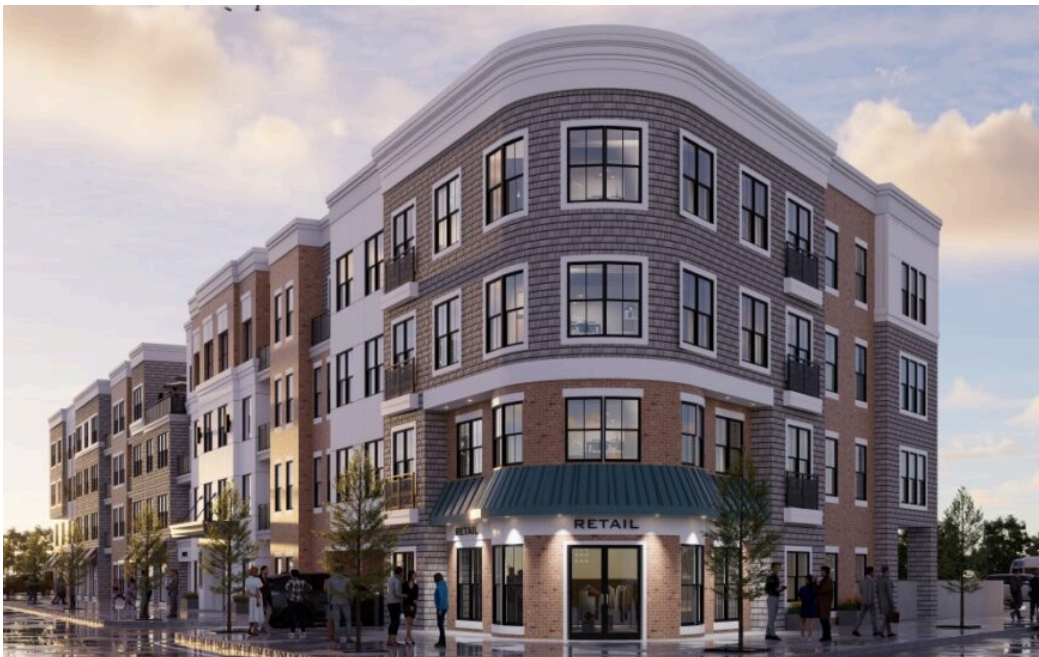
Rendering of the planned Cornerstone Hicksville development. / Courtesy of GRCH Architecture

Home(/) > News(https://Libn.Com/Category/News/) > Real Estate(https://Libn.Com/Category/News/Real-Estate/) > Town approves newest downtown Hicksville TOD project