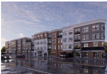
Cornerstone Hicksville will bring 106 apartments to a 2-acre site on Jerusalem Avenue.

The planned development is located a stone's throw from the Hicksville Long Island Rail Road station and will be built across the street from another transit-oriented project from Manhattan-based developer Alpine Residential (https://libn.com/tag/alpine-residential/?taxo-tag-body), which is bringing 189 apartments over 7,660 square feet of retail space on a 2.16-acre site and is expected to open in July.